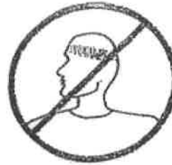
No Head Bands