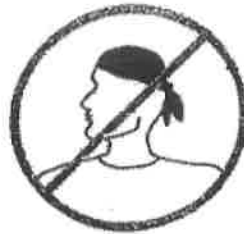
No Doo Rags