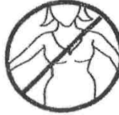
No Low-Cut Tops