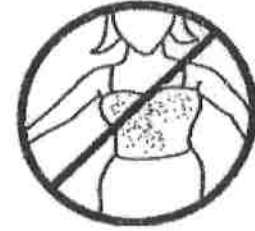
No Spaghetti Straps