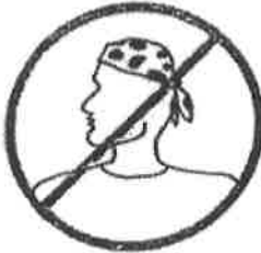
No Bandanas/Head Scarves