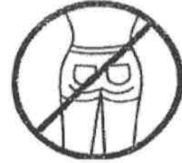
No Short Shorts