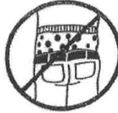
No Sagging Pants