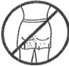
No Short Skirts