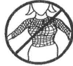
No See-Through Tops