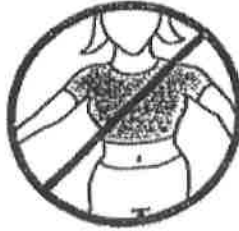
No Bare Midriffs