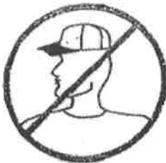
No Baseball Caps

STRICTLY ENFORCED ON CAMPUS BETWEEN 8:00AM-3:30PM