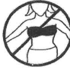
No Tube Tops