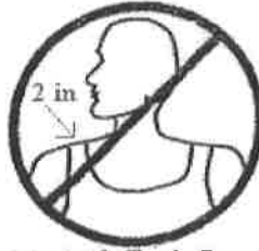
2 inch ok Tank Tops No Sleeveless Tops