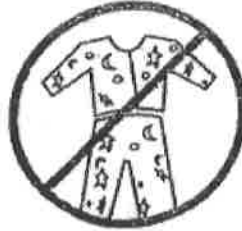
No Pajamas/Lounge Pants