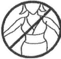
No Halter Tops