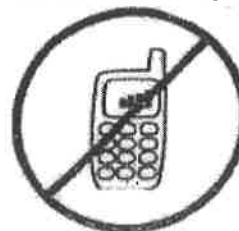
No Cell Phones or Electronic Receiving Devices