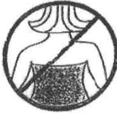
No Backless Tops No Single-Shoulder Tops